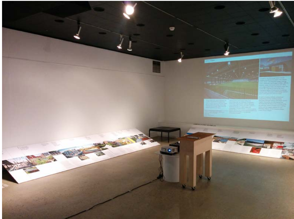
[View inside A2G: 2015 FIT Nation Exhibition]