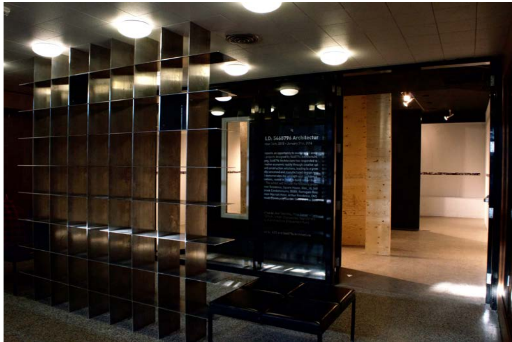
[View from lobby: 2015 BUILD: 5468796 Architecture Exhibition]