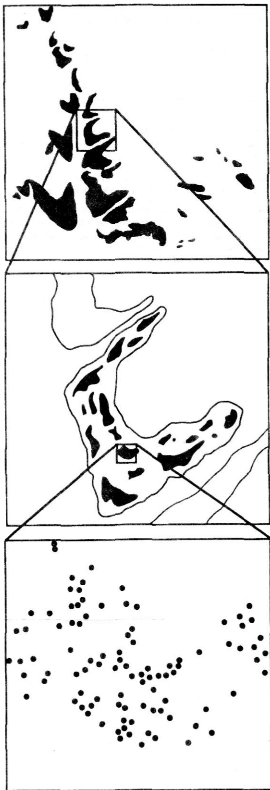
Figure 2. The spatial pattern of Clematis fremontii var. riehlii at three spatial scales (adapted from Erickson 1945).

scales; Silvertown & Lovett-Doust [1993: 108] illustrate the pattern over all five spatial scales mapped by Erickson). What is remarkable about this set of maps is the clear display of empirical self-similarity. Of course we recognize that this (or any other) spatial pattern is determined by a number of factors other than dispersal. For a species to occur at a given location, it must first of all arrive there. However, it may not succeed at a given site for a number of reasons. Abiotic conditions (e.g., edaphic factors) may not be favourable for germination and/or establishment, or the species may be outcompeted by other species. Historical factors (e.g. the occurrence and frequency of fire) will also play a role in determining species success at a site.