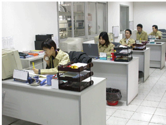
China's new industries

Some 200 million workers have been deployed in China's new industries since 1980. The conquest of global markets has helped to decimate America's and Europe's manufacturing in sectors raging from bedroom furniture to shoes, and from small tools to textiles, producing more than 90% of Wal-Mart's merchandise and contributing just over $200 billion (or about 26% of the total) to the US trade deficit in 2005 (USCB 2006). What a remarkable symbiosis: a Communist government guaranteeing a docile non-union workforce that labors without rights and often in military camp-like conditions in Western-financed factories so the multinational companies can expand their profits, increase Western trade deficits, and shrink non-Asian manufacturing. More of the same is to come, and before this wave is exhausted the country's manufacturing may dominate the global market of common consumer items as thoroughly as it now dominates Wal-Mart's selection.