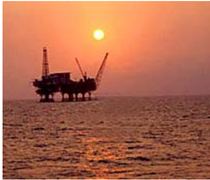
China's National Overseas Oil Company

What will China do with this new power? During most of the 1990s China's external actions were seen as overwhelmingly mercantile as the country appeared to be preoccupied with employing its huge surplus rural labor force and as its exports came from traditional labor-intensive categories in mature manufacturing sectors. But since the late 1990s China has become aggressive in a global quest for raw materials in general and for oil in particular (Zweig and Bi 2005). Chinese are ready to deal with Australian liquefied natural gas traders, Tehran's mullahs, or the Sudanese instigators of Darfur atrocities who control large untapped reserves of crude oil. Many commentators see the flood of China's manufactured products as an entirely welcome trend (they keep Western inflation rates low!), and many CEOs speak favorably about America's strategic partnership with China.