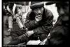
Japan's new homeless

about to unfold: in 2007 the first large cohort of elderly baby boomers will launch the country's mass retirement wave (typically at age 60); at the same time, increasing numbers of young people (already more than one million) have opted out of the labor market. This NEET generation (not in employment, education or training), which prefers hanging out in strange clothes and hairdos, can be seen as a sign both of Japan's national decline and its personal affluence.