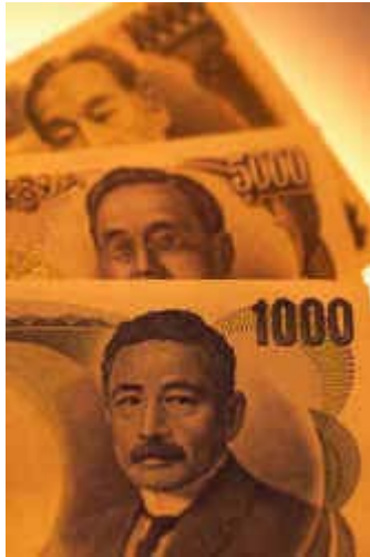
The value of the Yen spiraled following the Plaza Accord

As Japan's high-quality exports kept rising, Ezra Vogel (Harvard's leading expert on Japan) published a new edition (1985) of his seemingly prescient bestseller (it first appeared in 1979), Japan as Number One . Japan's expansive trend actually defied the revaluation of yen and accelerated during the next four years: the Nikkei index stood at just over 13,000 by the end of 1985 and it peaked at nearly 39,000 in December 1989. But right afterwards Japan's bubble economy burst in spectacular fashion (Wood 1992; Baumgartner 1995). History has no other example of a country whose standing switched so rapidly from that of a globally admired technical and manufacturing superpower to that of a deeply ailing, has-been economy.