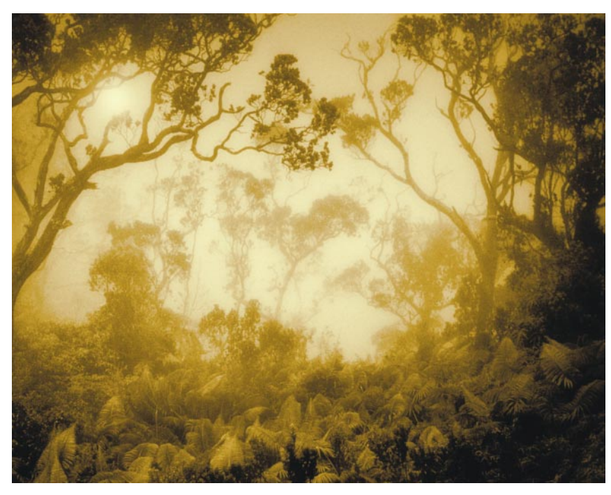
Tree of life: tropical forests support biodiversity by providing habitats for a huge range of insect species.

The subject is immense, encompassing the present state of life and its environment, as well as the history of the system over almost 4 billion years. To deal with a field of this complexity, two options are open. One can either try to organize the different aspects around a single vantage point, or just give a kaleidoscopic description of the state